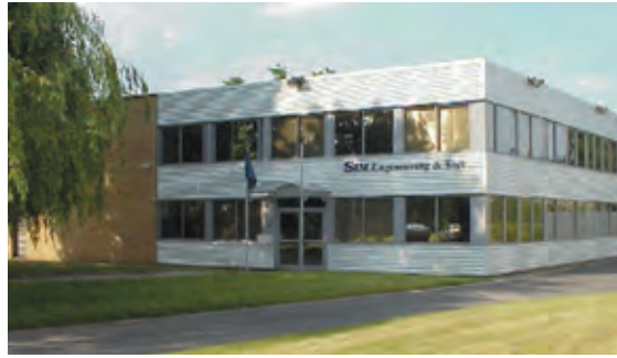
IAC's Research Centre in France houses an anechoic chamber, reverberant room and Kundt tube