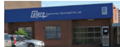
IAC Colpro Pty, Sydney, Australia