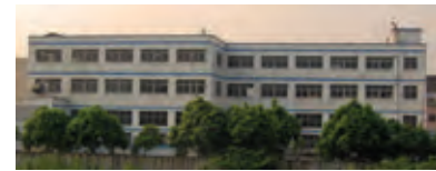
IAC China, Shenzhen, Peoples Republic of China