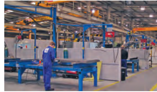
IAC's production plant at Winchester, UK