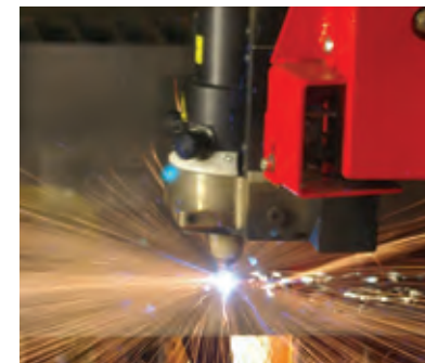
Bystronic Laser able to cut up to 25mm thick mild steel

In addition to the facilities directly owned and operated by the company, IAC works in close partnership with several other manufacturing organisations, notably in Eastern Europe, Middle East and India. IAC also has a large network of technical sales engineers, agents and distributors, offering advice and assistance to customers around the world. Several of these manufacture IAC products under license.