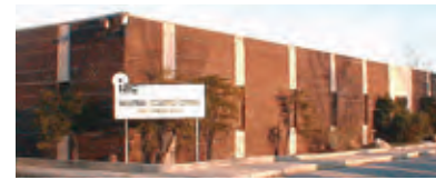
IAC America's Research and Manufacturing Centre in New York, USA