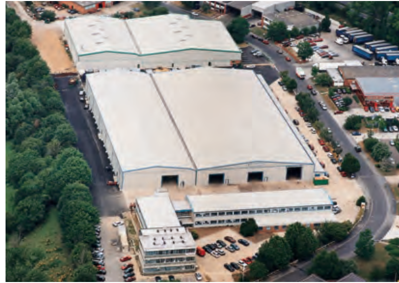
IAC's Global Headquarters at Winchester in the UK