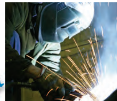
Heavy Duty Welding